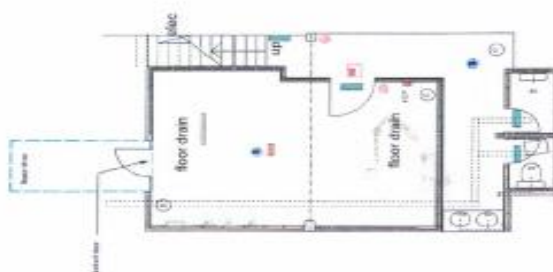
PROPOSED BASEMENT PLAN